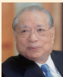
Daisaku Ikeda, Founder of Soka University